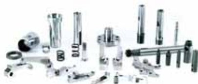
• ML TECH - ULTRA PRECISION MACHINING DIAMOND TOOLS