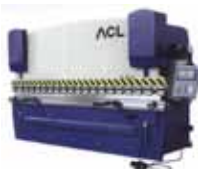
• ACL - WA67Y TORSION SYNCHRONIZATION PRESS BRAKE