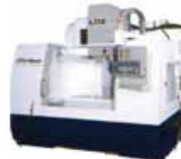
• LITZ - CNC MACHINE CENTER