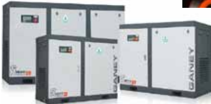
• GANEY - AIR COMPRESSOR