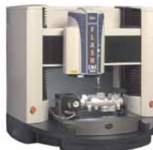
• OGP - SMARTSCOPE FLASH CNC MULTISENSOR METROLOGY SYSTEM

Optical Gaging (M) Sdn Bhd is a company selling metrology and quality control equipment and is a global leader in the manufacturer of non-contact and multi sensor metrology system. Whatever your metrology needs, OGP has a cost effective solution from manual inspection to fully automated.