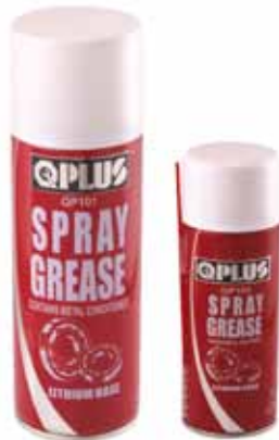
• QPLUS - SPRAY GREASE

Other Q Plus products includes Spray Grease, Chain Lubrication for motorbikes and bicycles, silicone spray, brake parts cleaner, anti static products and etc.