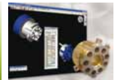
• GIBBSCAM - CAD/CAM FOR TOOL MAKING & MANUFACTURING