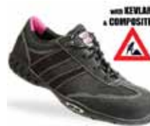
• SAFETY JOGGER - CERES-LADY LINE

PSP was formed on 2nd February 1994 to distribute and market a wide range of Personal Protective Equipment. We represent some of the most established agencies such as Ansell (Australia), Uvex (Germany), Moldex (USA), Neutronics (U.K.), Simon (Japan) & etc. Beside distributing full range of Personal Safety Products, we are also engaged in In-House Safety Training for all our customers. PSP has been committed to its core set of values: The customer, quality, innovation, teamwork and integrity, which serves as our operational foundation and are integrated into our overall business strategy. PSP provides the solutions that enables our customers to meet their demands.