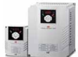
• LS - INVERTER