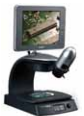
• SONY - VIDEO MICROSCOPE TW-TL12/10ZR