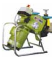
• CEVISA - CEVISA BEVELLING MACHINE, SPAIN