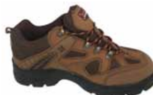
• HERCULES - SAFETY SHOES BG431-1

Hercules Machinery Gases Sdn Bhd was incorporated in 2001, and delivery of integrated solutions of welding, gas and safety products. We are industrial gases manufacturer and distributors in the Northern region. We also provide total welding solution ranging and recommendation of welding consumables, equipments need, and wide range of safety products. Our target is to provide the best efficient services to help our customer gain competitive advantages. To fulfill our customer's business requirement in this ever changing environment, we will continue expands and keep up-to-date our extensive range of products with latest technology and developments with our brands products.