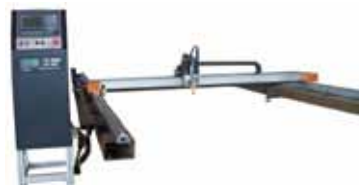
• CNC PORTABLE PLASMA CUTTING MACHINE

Mechkinarc (M) Sdn Bhd is the first sole-agent in Malaysia who distributes the high technology for cutting machine, new generations welding machine and welding equipments of the professional.