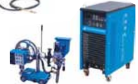
• M27 IGBT INVERTER AUTOMATIC SAW WELDING MACHINE