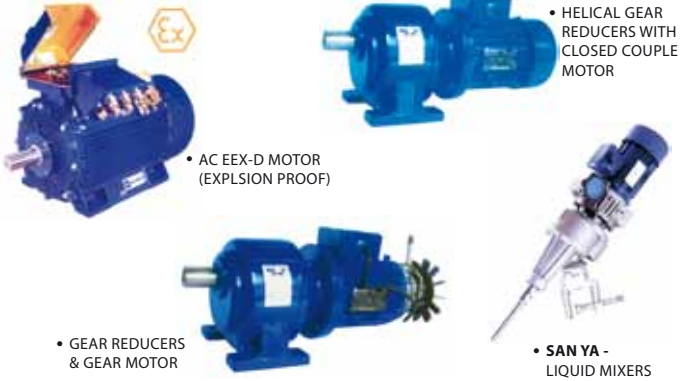
• AC EEX-D MOTOR (EXPLSION PROOF)

Helical Gearmotor, Agitator-Mixer, DC Brakemotor, Clutch & Brake, AC Induction Motor, Explosion Proof Motor, Planetary Gear, Lab Mixer.