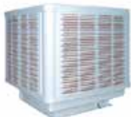
• ENERGY SAVING ENVIRONMENT CONTROL SYSTEM KT-1A