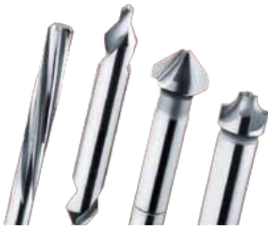
• DURA - REAMER, CENTRE DRILL

Incorporated in 2000, DURA TOOLS is one of the leading supplies in HSS, Powder Metallurgy & Carbide End Mill in Malaysia. We strive to provide cost effective solutions in metal cutting in order to increase the competitive advantage in this industry without compromising the quality.