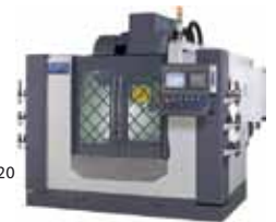
• EQUIPTOP - EMV-1020 MACHINING CENTER

ZMC Engineering (M) Sdn Bhd is the machine tool distribution for Hyundai-Kia and Equiptop. We supply the latest technology, cost effective and competitive price machinery for metal machining industries.