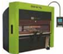
• SAFAN - E-BRAKE