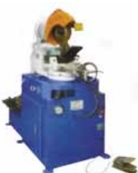
• CIRCULAR SAW MACHINE