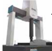
• WENZEL - 3D COORDINATE MEASURING MACHINE