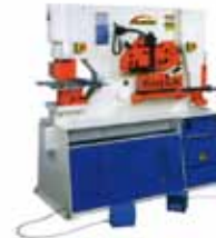
• SUNRISE - IRON WORKER