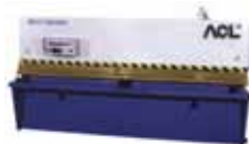
• ACL - QC12Y SERIES HYDRAULIC SWINGING BEAM SHEARER

Guan Kee has been well known in industrial market since 1982. Guan Kee are the sole agent of ACL products in ASEAN. Guan Kee are specializing in supplying full range of machinery and equipment used in sheet forming, duct making, steel manufacturing and much more industrial machine such as Plasma Cutting Machine, CNC Machine, NC Press Brake, NC Shearing, Roll Forming Machine, Slitting Machine, Milling Machine, Lathe, Power Press, Grinding Machine, Bandsaw Machine etc.