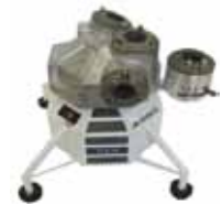
• APOLLO - ENDMILL RE-SHARPENING MACHINE - APOLLO 13 GEO, JAPAN