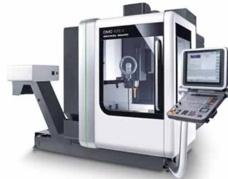
• DMG - DMC635V MACHINE

Please visit our stand for more information on our products and services.