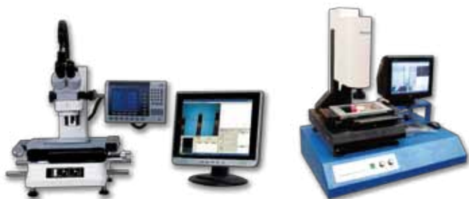
• EXACT - TOOLMAKER MICROSCOPE

Solid Black Metrology Sdn Bhd specialized in dimensional metrology equipment such as profile projector, video measuring system (VMS), toolmaker microscope and CMM. Solid Black has dedicated service team to support customers throughout the country. Technical personnel are well-trained and technical well-versed with good experience to provide excellent services.