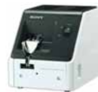
• SONY - AUTOMATIC SCREW FEEDER FK-707