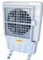
• ENERGY SAVING ENVIRONMENT CONTROL SYSTEM KT-1E