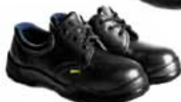
• NITTI - HIGH CUT PULL-ON SAFETY BOOT 23281