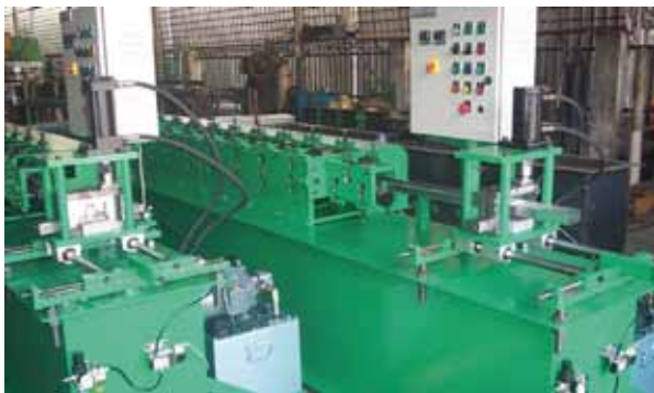
• ROLL FORMING MACHINE

Please visit our stand for more information on our products and services.