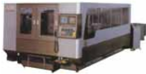
• KOMATSU NTC - LASER TLZ (F.O. SERIES)

Installing nothing below 500 units CNC machines in the country, our building/showroom/parts/service centre were set up as close as possible to our customer, namely Puchong (Central), Penang (North), and Johor (South). Also service support point will be set up in Ipoh and Malacca very soon too. NCT-Singapore were set up to service customer in Singapore and Batam of Indonesia services.