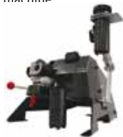
• BIC TOOL - SHOKEN DRILL RE-SHARPENING MACHINE, JAPAN