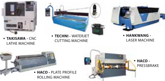
• TAKISAWA - CNC LATHE MACHINE

We also provide after sales technical support & application training.