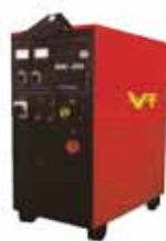
• VFWELD - CO2 MIG MACHINE