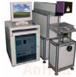
• DIODE SIDE-PUMP LASER MARKING MACHINE