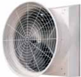
• OKURMA - FRP EXHAUST CONE FAN LR54-3DS