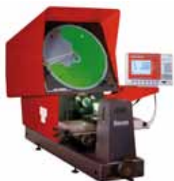
• STARRETT - HE400 HORIZONTAL BENCH-TOP OPTICAL PROJECTOR

Poly Achiever Sdn Bhd is sold distributor for 'Taegutec' tooling system from Korea and Dormer cutting tool. For measuring, we have 'Starrett' precision measuring instrument, KAIFER Dial Gauge and also 'Bao-Z' Taiwan video machine.