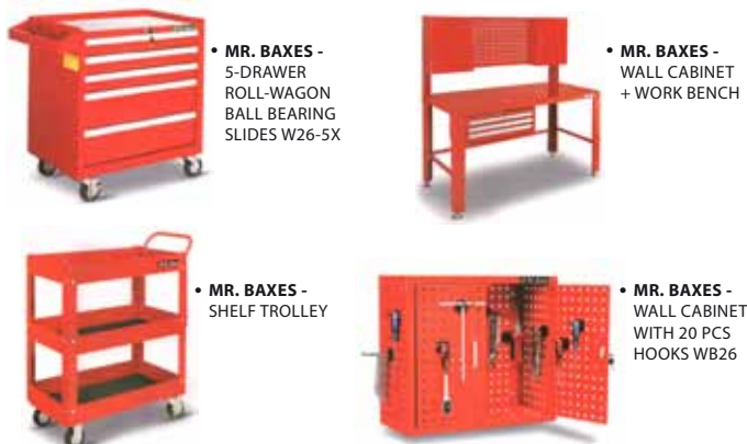
• MR. BAXES - 5-DRAWER ROLL-WAGON BALL BEARING SLIDES W26-5X

Manufacturing of tooling cabinet, work benches and other storage solutions.