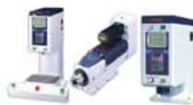
• JANOME - ELECTRO PRESS JP SERIES 4

SONY : Automatic Screw Feeder, Video Microscope