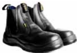
• NITTI - HIGH CUT PULL-ON SAFETY BOOT 23281