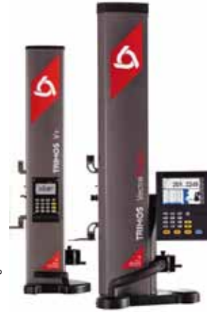
• TRIMOS - TOUGH HEIGHT GAUGES FOR THE WORKSHOP

WT Precision took pride in providing the highest level of after-sales service, technical support and distribution of precision measuring instruments and associate accessories.