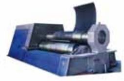
• NC PLATE ROLLING MACHINE