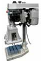
• TAPPING MACHINE