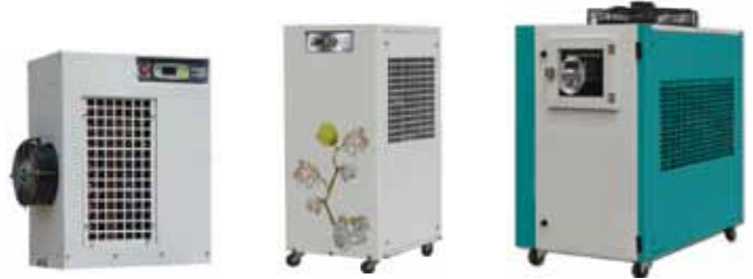
• PANEL COOLER

We are the local manufacturer specialize in process cooling and heating. We supply Industrial Water Chillers (0.5-200HP; the lowest of -30°C; temperature accuracy of ±0.1°C), Mini Water Chillers, Refrigerator Air Cooler and Panel Cooler, Cooling Bath, Chilled Water Dispenses (supply 3°C water in 9-11 min), Honeycomb Dehumidifier, Room Dehumidifier, Mould Temperature Controller, Cabinet Dryer, Auto Loader, Hot Runner, etc.