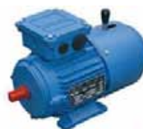
• EIM MOTOR

Vostrax is a one stop solution provider in Automation Technology. We are selling on major industrial engineering products. Industrial Automation products electrical components and we do have services like on-site trouble shooting, commissioning, electrical panel and system integration.