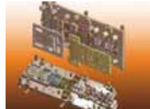
• CIMATRON - CAD/CAM SOLUTION FOR DIE MAKING

We will be able to support you to save cost and deliver in the shortest time. High tech manufacturing solution from 2 AXIS to 5 AXIS milling, basic turning to mill-turn and to mestone to multi AXIS multi task machining. We have the right solutions and skilful personnel to assist you to meets your goals.