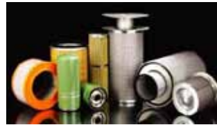
• APUREDA - AIR FILTER, OIL FILTER, SEPARATOR

Years of experience, exclusive use of high quality, proven components, efficient production on modern assembly lines. Our compressor increasingly reliable and efficient with reduced specific power and low noise levels.