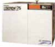
• EXTRO MACHINERY - HISCREW INVERTER