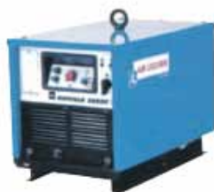
• SAF - BUFFALO 5001