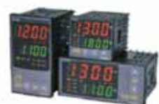
• AUTONICS - TEMPERATURE CONTROLLERS TK SERIES

Autonics always tries to achieve Customer Satisfaction with highly qualified, wide ranged products & reliable services through constant R&D efforts and quality management process. Autonics always do the best to meet international needs in order to become a global IA partner all over the world.