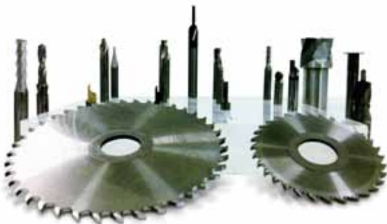
• TCT - CTU SPECIAL TOOLS