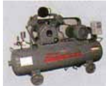
• EXTRO MACHINERY - BEBICON