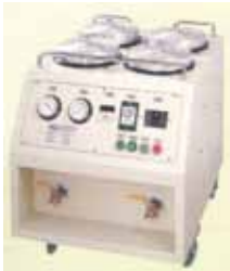
• FILTROIIL - FILTERING MACHINE - FOCUS-4H