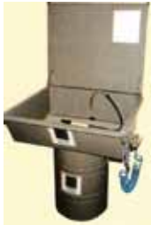
• JW 1001 CLEANING SYSTEM