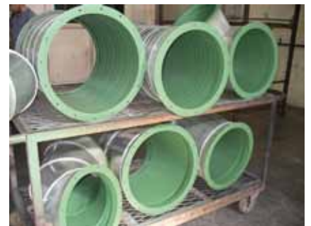
• EMPICO - LAB DUCTING