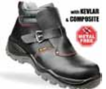
• SAFETY JOGGER - MERCURIUS-300°C HEAT