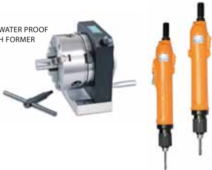
• BSD - ELECTRIC SCREWDRIVERS