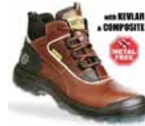
• SAFETY JOGGER - GEOS