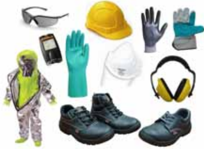
• PERSONAL PROTECTIVE EQUIPMENTS

SAFETYWARE SDN BHD is one of the largest integrated health & safety solution providers in Malaysia which offers complete solution spanning across 4 divisions namely Professional, Consumers, Engineering, Training & Consultation. We possess more than 28 years of experience in the safety industry as we started as the pioneer rubber gloves manufacturer in 1983. Our group has been exporting to more than 60 countries and we offer more than 3000 types of safety products.