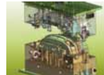
• CIMATRON - CAD/CAM SOLUTION FOR MOULD MAKING