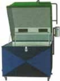
• PARTS WASHER

Our cleaning system which is a heavy duty air-operated system designed for easy cleaning by brushing through an adjusted flexible hose with a steady stream of chemical cleaning up is easy and fast with minimal maintenance.