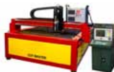
• CNC PLASMA CUTTING MACHINE