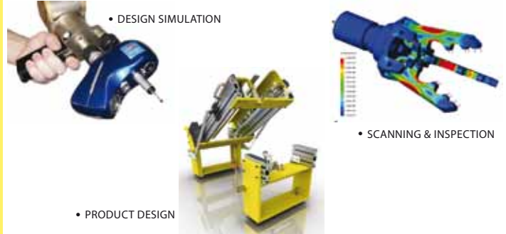
• DESIGN SIMULATION

As a leading CAD/CAM & CAE solutions provider with more than 100 staffs (70% of them are certified technical specialist) and more than 600 clients nationwide, IME Group of Companies provide innovative design and manufacturing solutions and services to ensure our industries and educational institutions fulfill their design and manufacturing needs faster, better and in a cost effective manner.