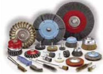
• UNION INDUSTRIAL BRUSHES

Duoflex, And Industrial Brush Specialist, Offer Full Range Of Industrial Brushes Including Custom Made Brush To Meet Specific Needs And Technical Requirements Regardless Of The Variety Of Brush Designs, We Also Offer Full Range Of Brush Materials/Filaments To Serve For Common Requirements (Brass Control, Steel, Stainless Steel), Cleaning Purpose (Nylon 6, 66, 612), High Temperature Application (Pk, Pm, Htn), Deburring And Publishing (Abrasive Nylon), Safety Requirements (Han-Spark Material, Etc).