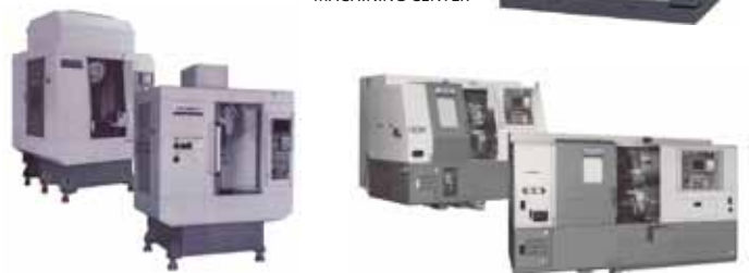
• HYUNDAI KIA - VERTICAL TAPPING CENTER - VX380 SERIES