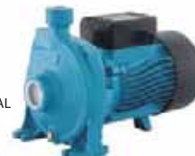
• LEO - CENTRIFUGAL PUMP - XCM-130