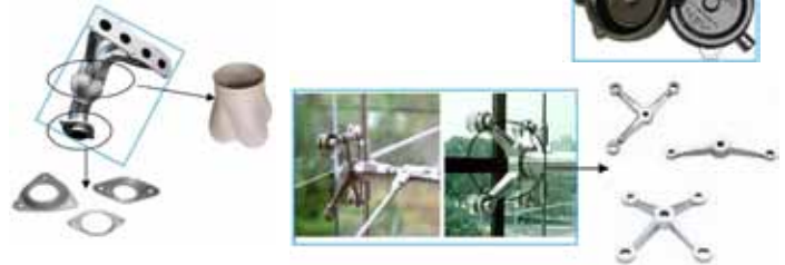
• STAINLESS STEEL, LOW & HIGH CARBON STEELS, BRONZE, ALUMINIUM AND BRASS CASTING

We specialize in stainless steel, low & high carbon steels, bronze, aluminium and brass casting.