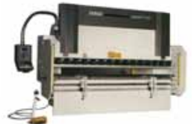
• ERMAK - HYDRAULIC PRESS BRAKE

To supply full range of machinery and equipment in steel manufacturing, ship building, precision engineering, oil and gas and other industrial machine such as CNC plasma cutting machine, CNC machine, press brake and shearing machine. We also service and repair all types of machineries.