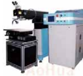
• LASER MOULD WELDING MACHINE

We provide after sales services to our M/C and also wear & tear parts as well. Sample for testing are welcome.