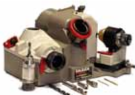
• DAREX - XT3000 DRILL GRINDER & SHARPENER

Established in 1980, Intec is a trading company dealing in tooling, metrology, machining and related accessories in the engineering industry. We are the only personal and one-stop supplier for quality and affordable equipment with our unique combination of product range, from callipers and deburring tools, to coordinate measuring machines and CNC deep hole drilling machines. Our commitments to good value, applicable products and reliable service have made us a trustworthy household name in the industry around Asia. Intec aims to provide efficient and effective solutions for our clients engineering, automotive and die & mould, as well as in the regional countries of South East Asia such as Malaysia, Indonesia and Thailand.