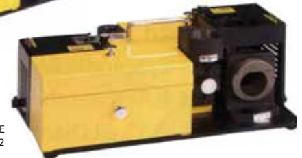
• HOW-MAU - PORTABLE DRILL GRINDER DR-232