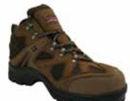
• HERCULES - SAFETY SHOES BG431