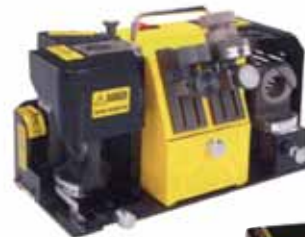
• HOW-MAU - COMPLEX DRILL & END MILLS GRINDER CDE-220

Press die standard components & metal stamping machinery.