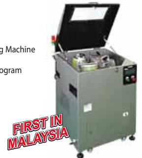
• SANKEI - COMPACT HIGH PRECISION DEBURRING & SURFACE FINISHING MACHINE