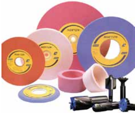
• NORTON - SURFACE & TOOLROOM GRINDING WHEELS

Abrasive products, cutting tools, diamond & CBN wheels.