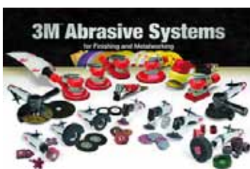
• 3M - ABRASIVE SYSTEMS

Login to www.sourcingsingapore.com.sg for all your Singapore industrial supplier information.