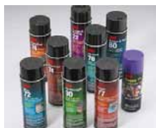
• 3M - ADHESIVE