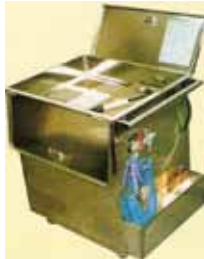
• JW 1008 CLEANING SYSTEM