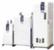
• EXTRO MACHINERY - SMC REFRIGERATED AIR DRYER SERIES

Other products we supply are: refrigerant / desiccant air dryer, air preparation unit / filters, circuit breaker, machinery. air, receiver, pressure cleaner, water pump, general hardware and machinery.